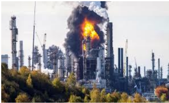
Saint John Oil Refinery