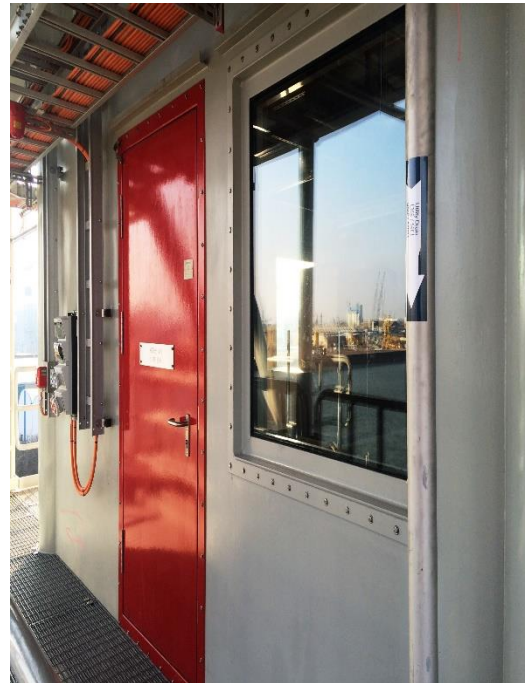
FIRE / JET-FIRE RESISTANT WINDOWS.