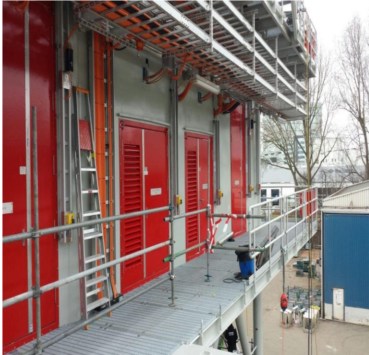
FIRE & BLAST RESISTANT DOORS.