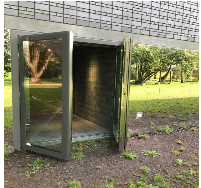
GLASS HINGED DOORS – BLASTPROOF.