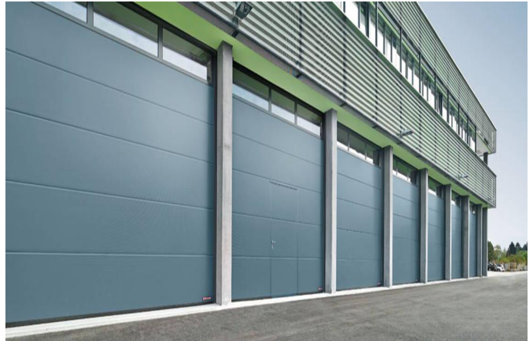
INDUSTRIAL SECTIONAL DOORS.