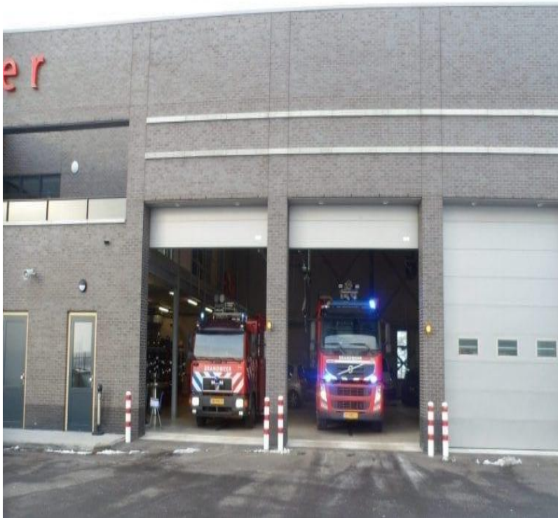
EXPLOSION / BLAST PROOF DOORS.