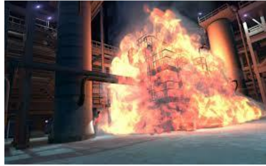
Process Safety incidents.