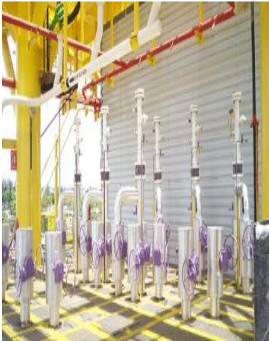
FIRE & BLAST RESISTANT WALLS.