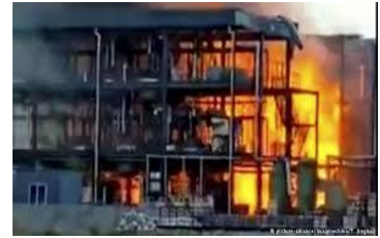
Chemical Plant Blast.