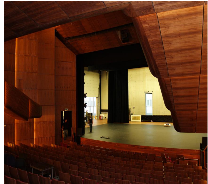
LARGE ACOUSTIC SECTIONAL OVERHEAD DOORS.