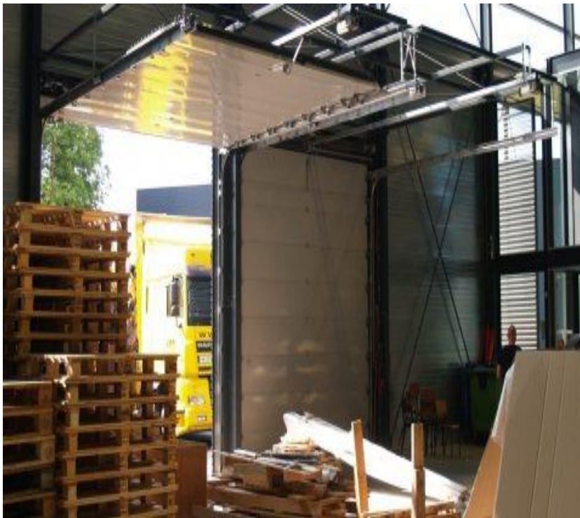
FIRE RESISTANT OVER HEAD DOORS.