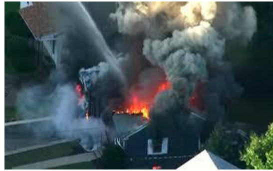
Massachusetts Gas Explosions.