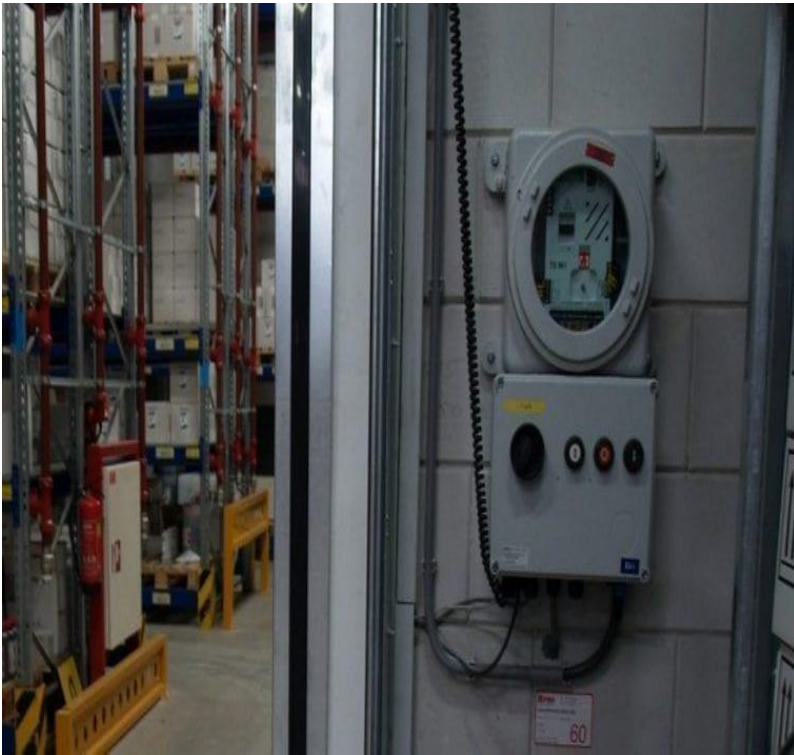
EXPLOSION SAFETY ATEX DOORS.