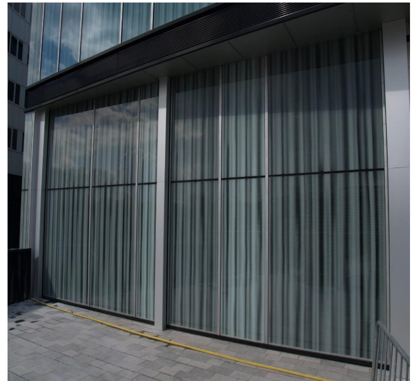
SPECIALTY SECTIONAL DOORS – GLASS FACADE