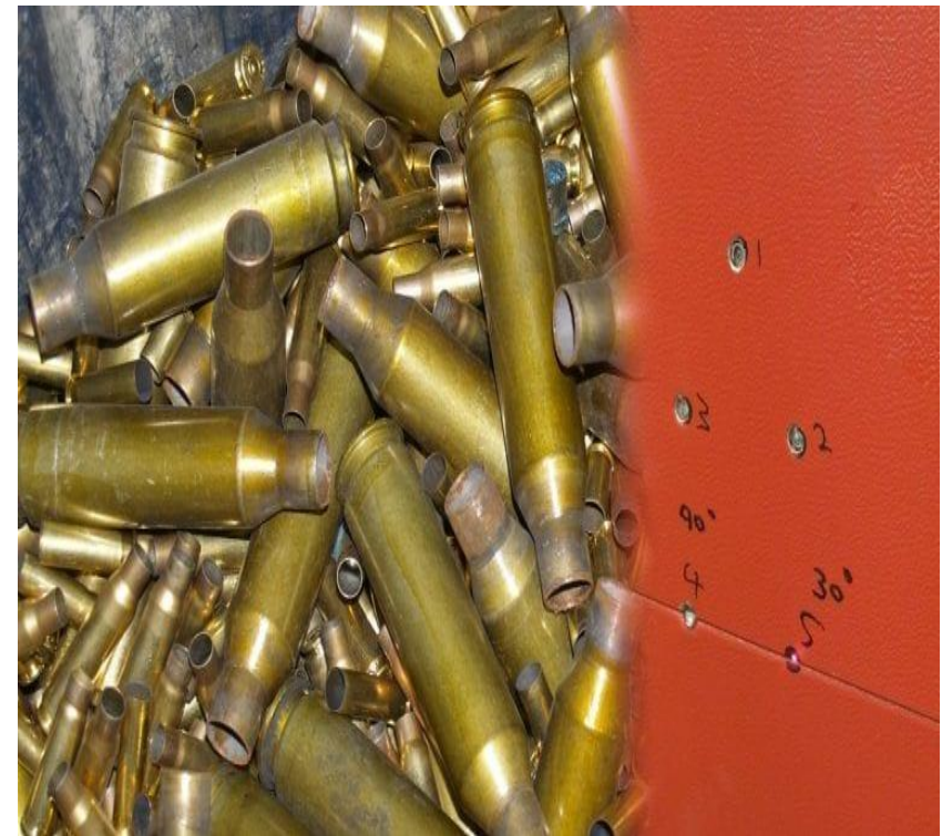
BULLET PROOF DOORS.