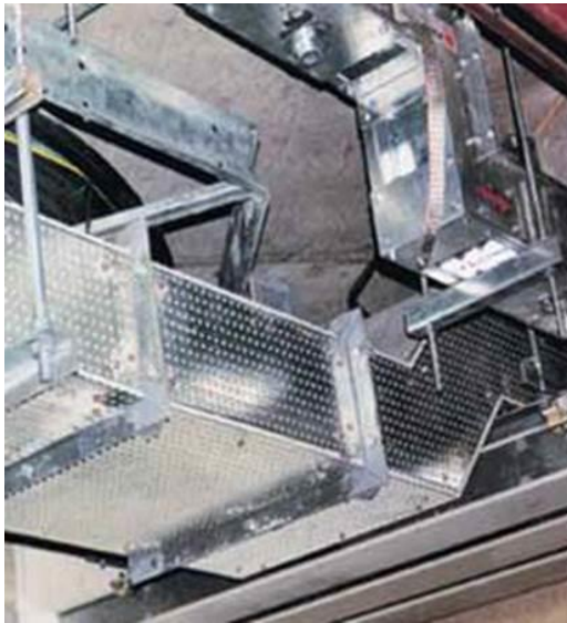
AIR, SMOKE EXTRACTION DUCTS.