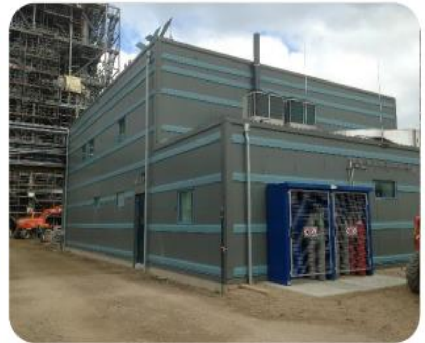
FIRE & BLAST RESISTANT STRUCTURES.