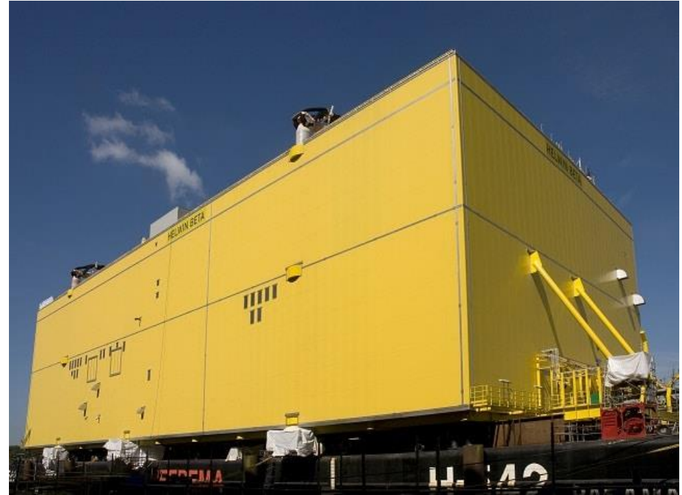
FIRE RESISTANT WALLS.