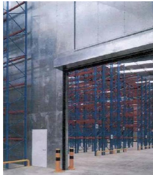
WALLS & PARTITIONS, CLADDING.