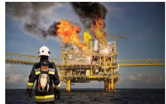
Oil Rig disaster.